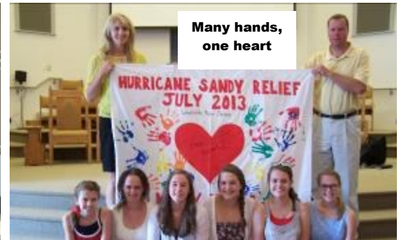
Many hands, one heart