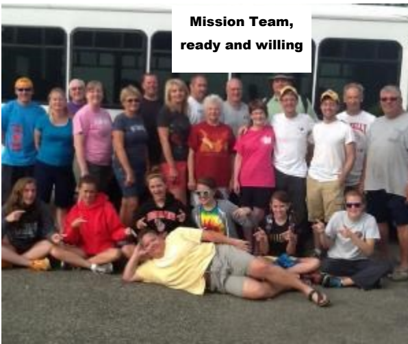
Mission Team, ready and willing