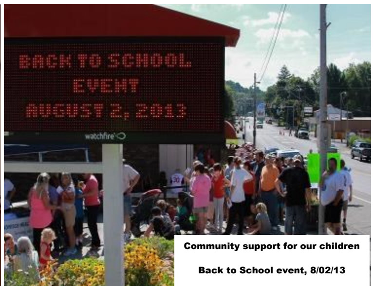
Community support for our children Back to School event, 8/02/13