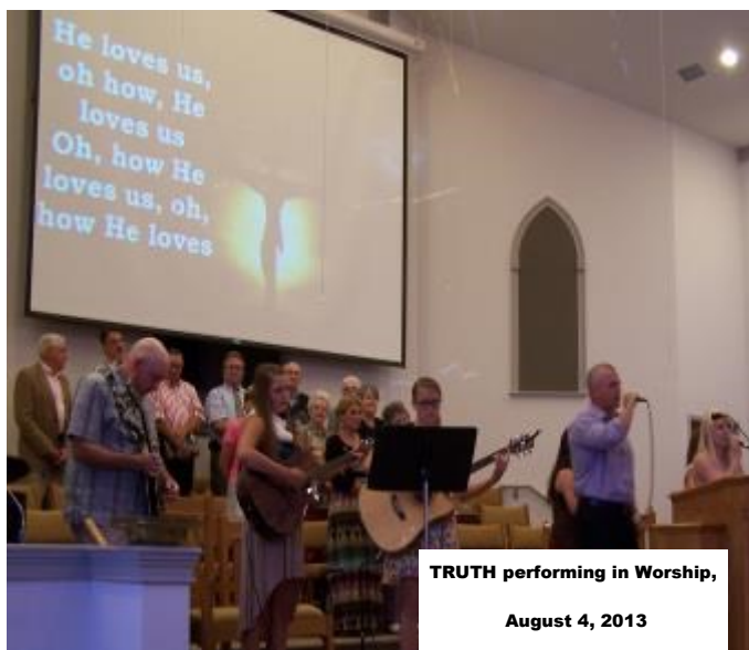
TRUTH performing in Worship, August 4, 2013